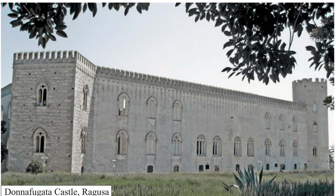
Donnafugata Castle, Ragusa

The event will be held from 24 th to 26 th June 2019 in the fascinating location of the Donnafugata Castle, a sumptuous noble residence of the late '800 a few kilometers from Ragusa.