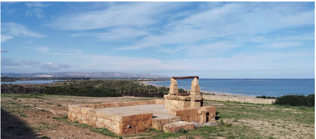
Cittadella area in the Natural Reserve of Vendicari