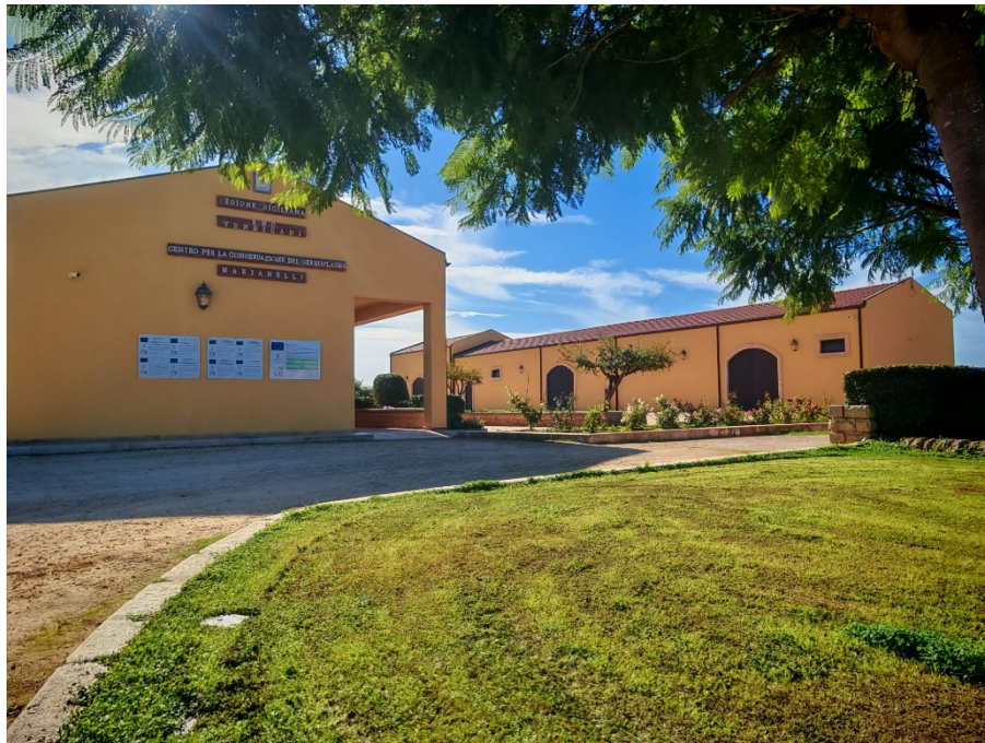
Marianelli facilities in the Natural Reserve of Vendicari

The event will be held at the Case Cittadella and Marianelli facilities, inside the Natural Reserve of Vendicari, the latter being a Center for the Conservation of Agricultural and Forestry Germplasm.