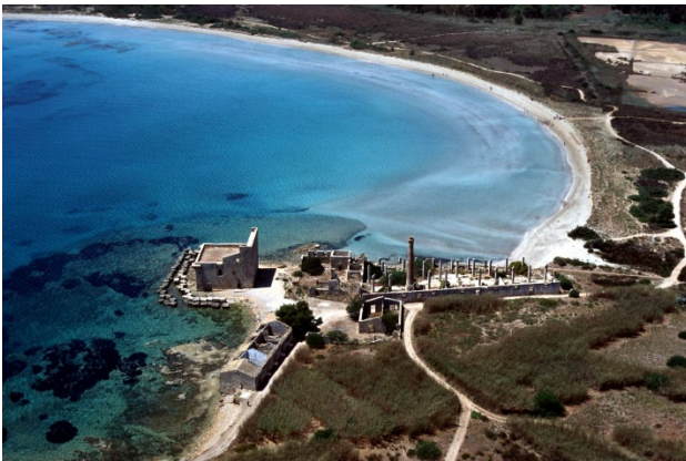
Ancient tuna fishery complex in the Reserve

Man and Karst 2026 in Sicily, in the same way as the previous editions, wants to give a contribution to the knowledge, enhancement and safeguard of the karst landscape with its ecosystem and historical-anthropological resources as a whole, as an instrument and optimal function of scientific research, not as often for its own sake or for the sake of a few users, but rather, at the service and for the benefit of the whole community.