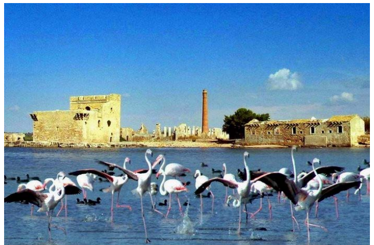
Flamingos in the marshes of the Reserve